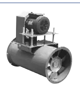
Tubeaxial Inline Fans