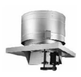
HI-EX Power Roof Ventilator